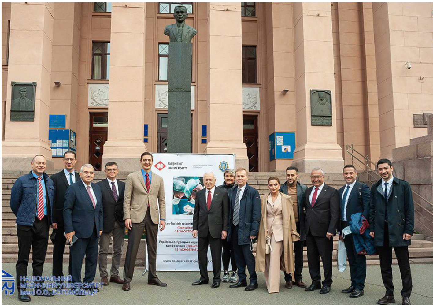
▲ Group photo taken in front of the National O. O. Bogomolets Medical University

to encourage and assist Ukrainian colleagues in establishing successful transplant programs for end stage organ disease patients.