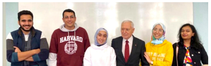
Organ transplantation conference ✨🔥