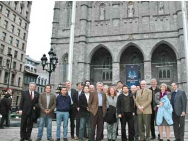
Participants visited Old Montreal and took in a sound and light show at the historic Notre-Dame Basilica.