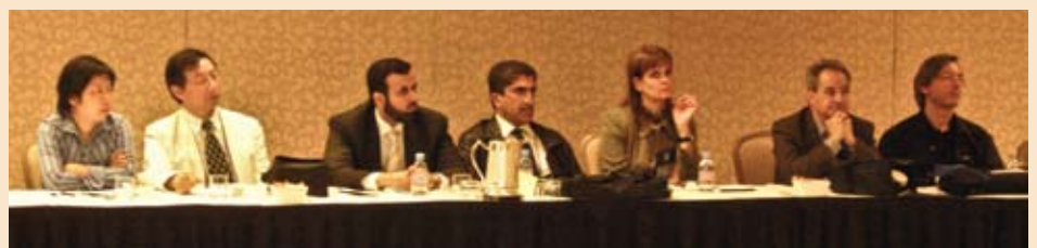
Country Liaison Representatives at the meeting in San Francisco.