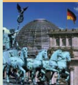
Berlin's Brandenburg Reichstag

Germany's capital and biggest city, Berlin, has been selected as the site for the XXIV International Congress of The Transplantation Society. With over 600 ballots cast, the members' vote was a very tight race with Berlin edging out Gothenburg.